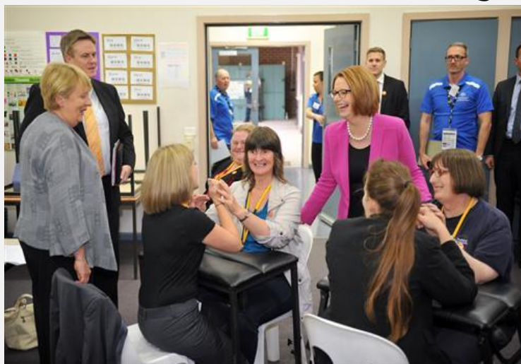
Left - Members of DeafBlind Victorians meet former Prime Minister, Julia Gillard